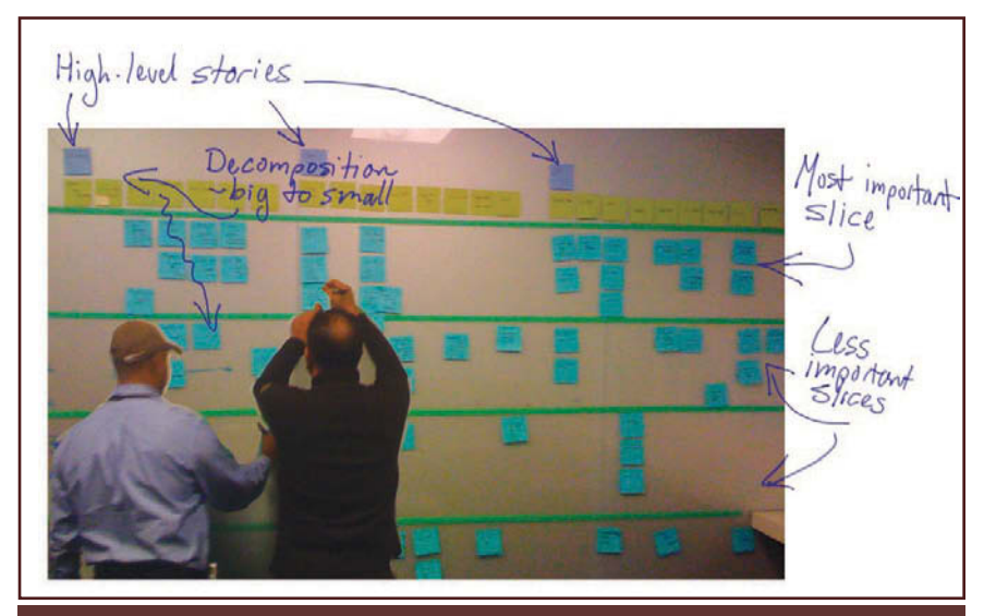
Figure 1: User Story Mapping

Right sized—High-level conversations have high-level stories; detailed conversations have more detailed stories. Conversations must be enabled at the executive level and at the detailed development level.